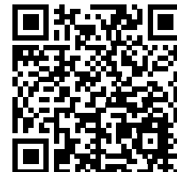
Follow on Facebook